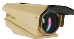
14° to 1.1° FoV