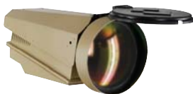
6.3° to 0.5° FoV 9.4° to 0.75° FoV