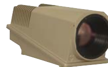
25° to 2° FoV