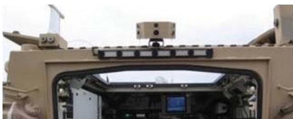
With a 180° field of view, the SA180 is well suited for vehicle applications

With its high resolution, large format sensors, the SA180 can detect a human at over 500 meters (when digital zoom used)